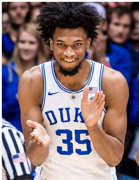
» Marvin Bagley III is just the second player under Coach K to have a performance of 30+ points and 15+ rebounds. He is second in the NCAA with five double-doubles.